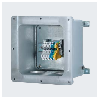
Terminal and junction boxes Ex d in aluminum or stainless steel