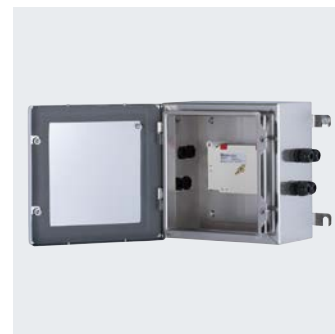
Fiber optic splice boxes and high voltage junction boxes