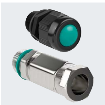
Cable glands Ex d/Ex e in polyamide, nickel-plated brass, or stainless steel