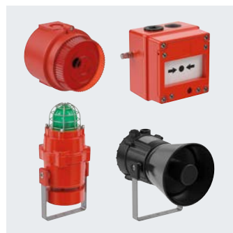
Beacons, sounders, combination devices and manual call points for hazardous areas