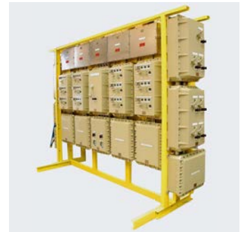
Combined Ex de distribution panels in aluminum for gas group IIB