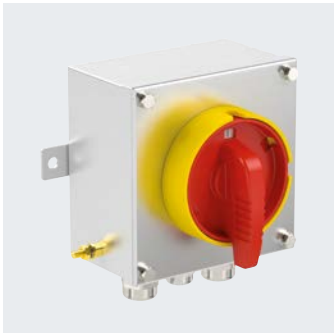
Disconnect and safety switches in stainless steel, GRP or aluminum in Ex e or Ex d