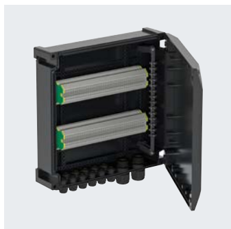
Terminal and junction boxes Ex e/Ex i in GRP