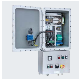
Combined Ex de control panels in aluminum or stainless steel for gas groups IIB+H 2 or IIC