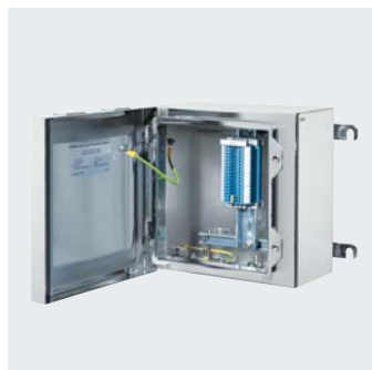
Terminal and junction boxes Ex e/Ex i in stainless steel also for Class I Div. 2