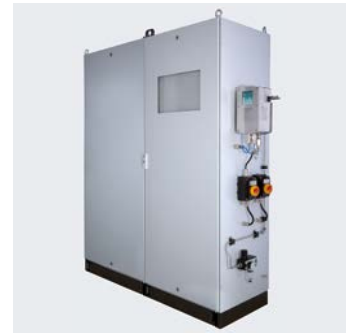
Purge panels and controllers for Ex px, Ex py, or Ex pz and Type X, Y, or Z according to ATEX, IECEx, or North American (NFPA) requirements