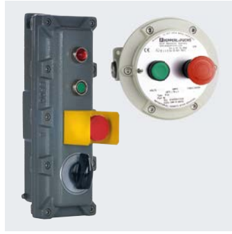
Local control units Ex d in aluminum