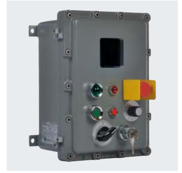
Control stations Ex d IIB+H 2 or IIC in aluminum or stainless steel