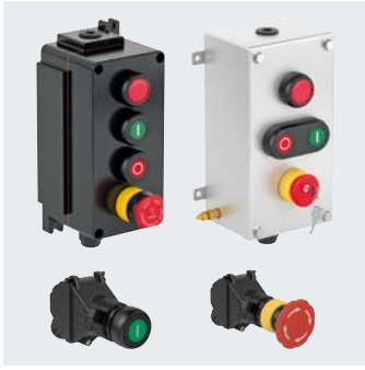
Local control units Ex e/Ex i in stainless steel or GRP or for panel mounting