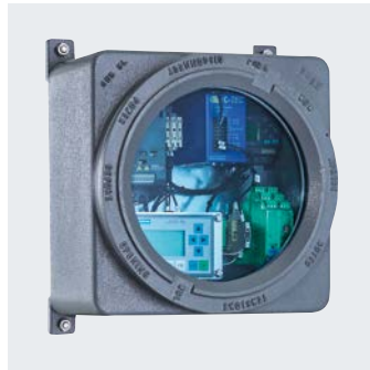
Control panels Ex d IIC in aluminum or stainless steel