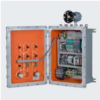
Ex d control panels in aluminum or stainless steel for gas group IIB+H 2