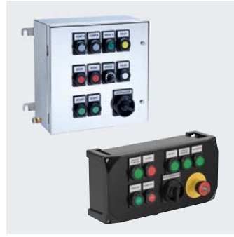
Control stations Ex e in stainless steel or GRP